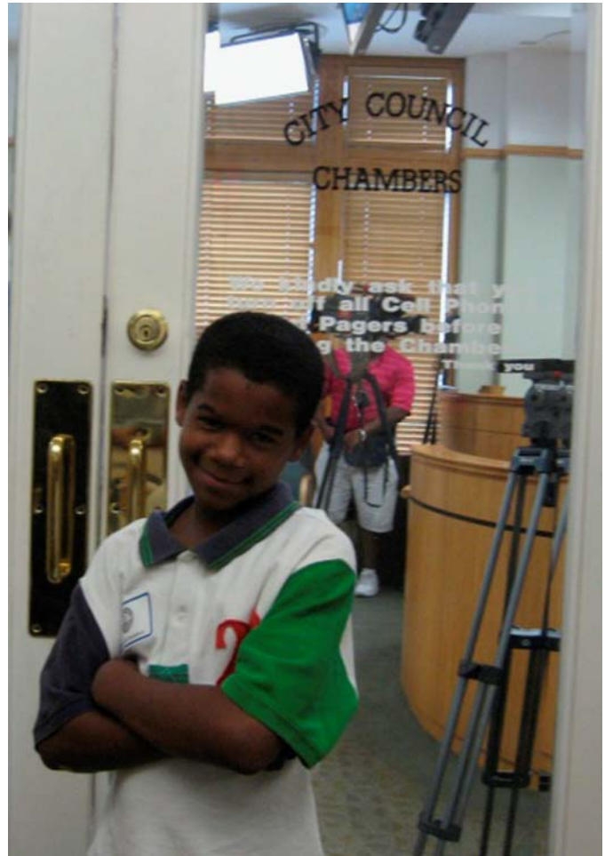
Moses House youth at the door of Tampa City Council Chambers.