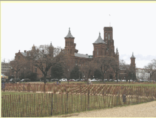
Washington, D.C. -- Smithsonian