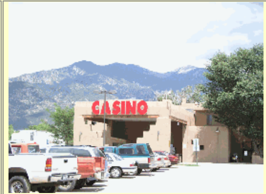
Taos, NM -- Taos Mountain Casino

Course Description: An overview of contemporary U.S. culture, with an emphasis on how diversity (e.g., ethnicity, class, religion, and gender) is expressed in communities, in regions, and in the nation.